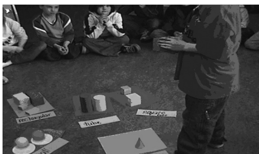
Figure 3. A moment in the “sort-the-mystery-object” task, where each child gets a turn in sorting an initially unknown object by placing it, as shown on an occupied or unoccupied colored sheet, each representing a (named) collection of like objects.

The sorting task that constituted the first and introductory lesson of the curriculum unit required the participating second-grade students to pull a “mystery object” from a black plastic bag and then place it with an existing group (collection, category) of objects or create a new group (Figure 3) 9 . To start the task, the teacher has pulled an object, has placed it on a colored sheet, and thereby has begun a first group. Each of the 22 children in the class has its turn to pull and place/sort an object. At the end of the lesson, all 22 students have placed their objects. But in every single case, students do not initially articulate a rationale for the placement (grouping) of their object. The teacher then invites them to articulate their thinking, that is, to produce predicates that explain why they have placed their object in a particular group (“Now can you tell us what you are thinking?” “Explain your thinking!” “You have to tell us why!” “Before going on, explain your thinking!” “Don't go away, tell us why you put it there?”).